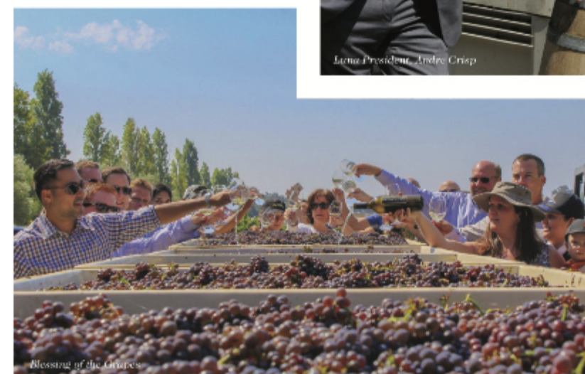
Blessing of the Grapes