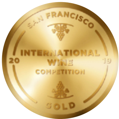
Gold, San Francisco International Wine Competition

WINE Luna Vineyards Petit Verdot VINTAGE 2016 SCORE Gold